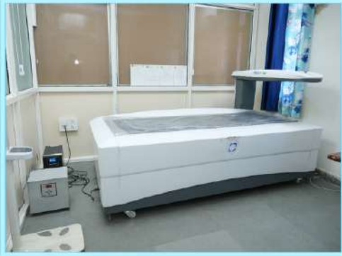
3D DEXA BMD SCAN