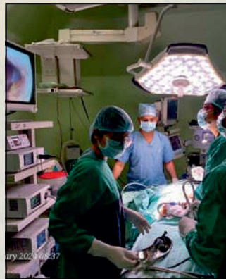
LAPAROSCOPIC SURGERY UNIT