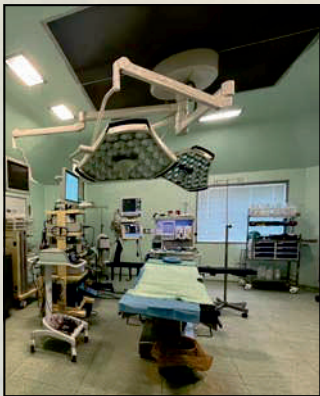
MODULAR OT COMPLEX

With warm regards, Organizing Committee SAUSHRUTAM 2026 All India Institute of Ayurveda, New Delhi