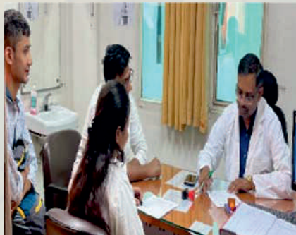
Guda Roga OPD